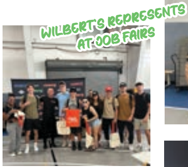
WILBERT'S REPRESENTS AT JOB FAIRS