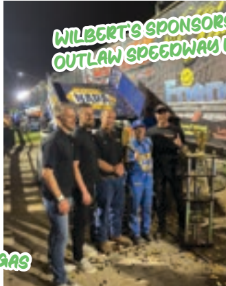
WILBERT'S SPONSORS AN OUTLAW SPEEDWAY RACE