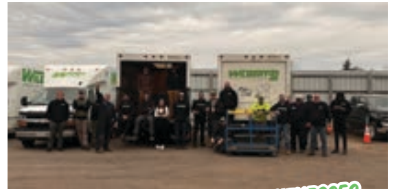
WILBERT'S WITNESSES THE ECLIPSE (KINDA)