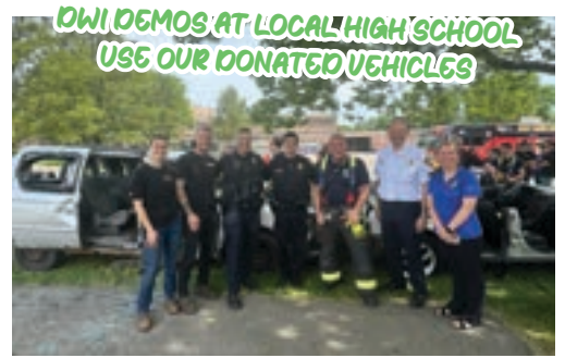
DWI DEMOS AT LOCAL HIGH SCHOOL USE OUR DONATED VEHICLES