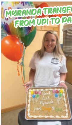
MURANDA TRANSFERS FROM UPI TO PAP